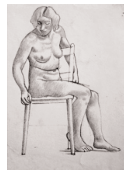
'The drawings of the nude figure by Mr. William Roberts are interesting as showing that the tubular convention of this artist is not due to incapacity to draw the forms of nature' – The Times , 26 November 1926, reviewing an exhibition at the Savile Gallery